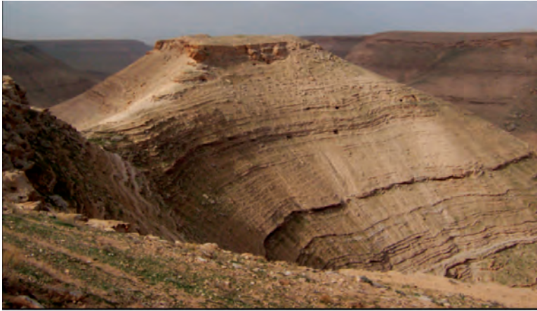
Fig. 2. Khirbet el-M(u)deyyeneh from the south