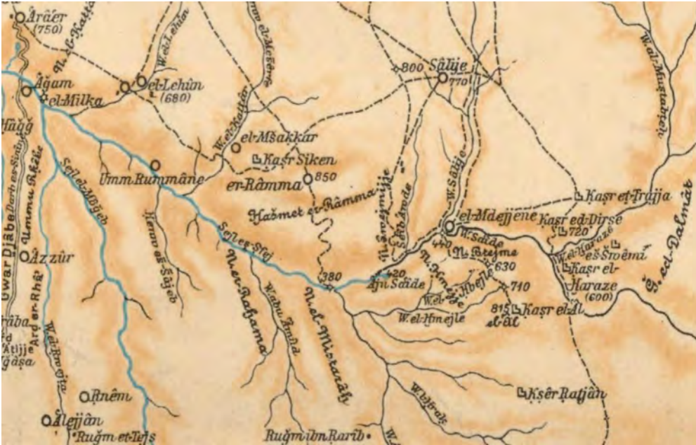
Fig. 4. Excerpt, taken from Alois Musil, Ḳuṣejr ʿAmra , Karte von Arabia Petraea , http://mapy.vkol.cz/mapy/v61955_002.htm