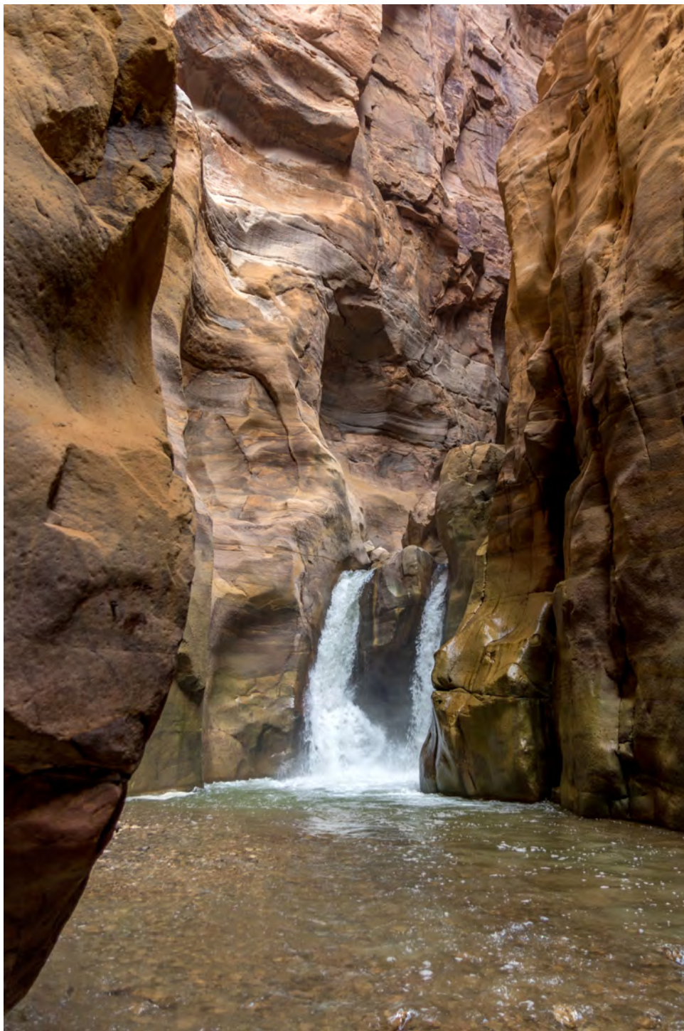
Fig. 6. Nahal Arnon near the Dead Sea.