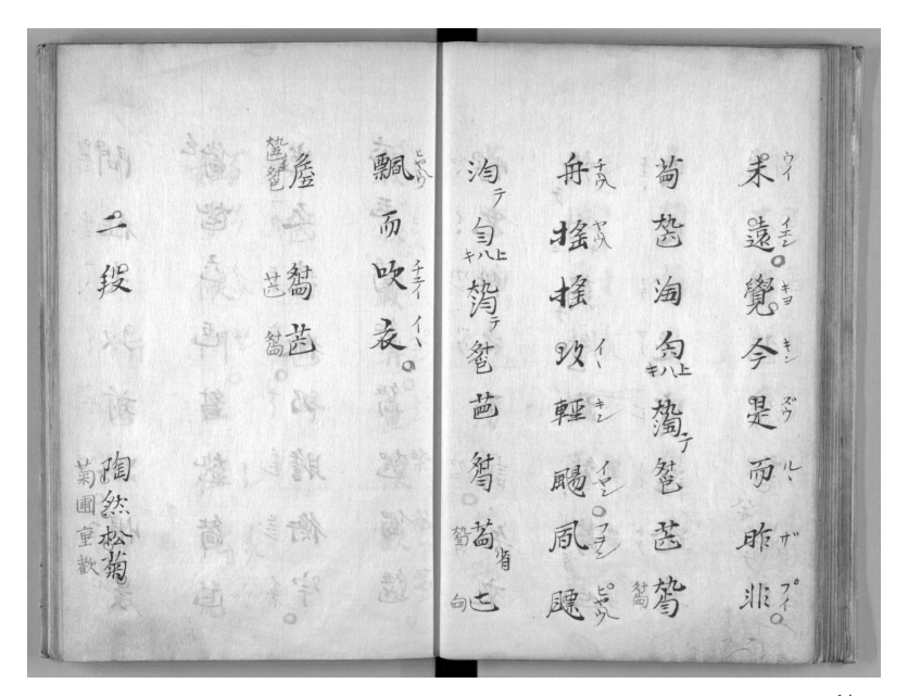
Fig. 2. A page from a late Edo period manuscript copy of Donggao qinpu 14

13. See Qinqu jicheng 12: 248. Each Chinese character is transliterated into katakana written on its right side. A circle on one of the corners (lower right, upper right, upper left, or lower left) of a Chinese character indicates the tone (correspondingly, ping , shang , qu , or ru ), not to be confused with a punctuation mark, which is a circle right below a character. Yang Yuanzheng notes that "all the linguistic annotations were engraved into the body of the notation. They were not inserted by hand when the music was taught, but solidified in woodblock with the tablature itself and constituted an organic part of the notation"; Yang, "Japonifying the Qin ," 77.