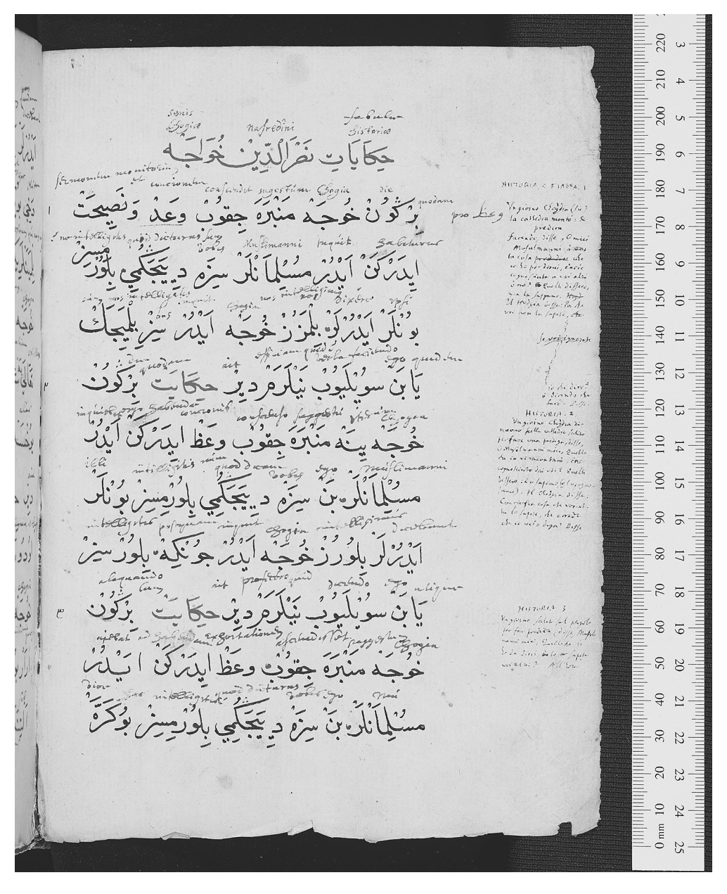
MS. Marsh 42, fol. 47b